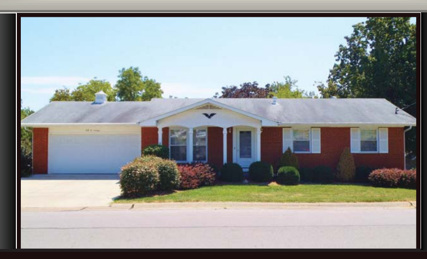
DIRECTIONS: From Hwy. 61 and Hwy. 47 intersection, go West on Hwy. 47 to LEFT on Main Street to RIGHT on W. College to home on LEFT. WATCH FOR KAIMANN AUCTION SIGNS DAY OF SALE!