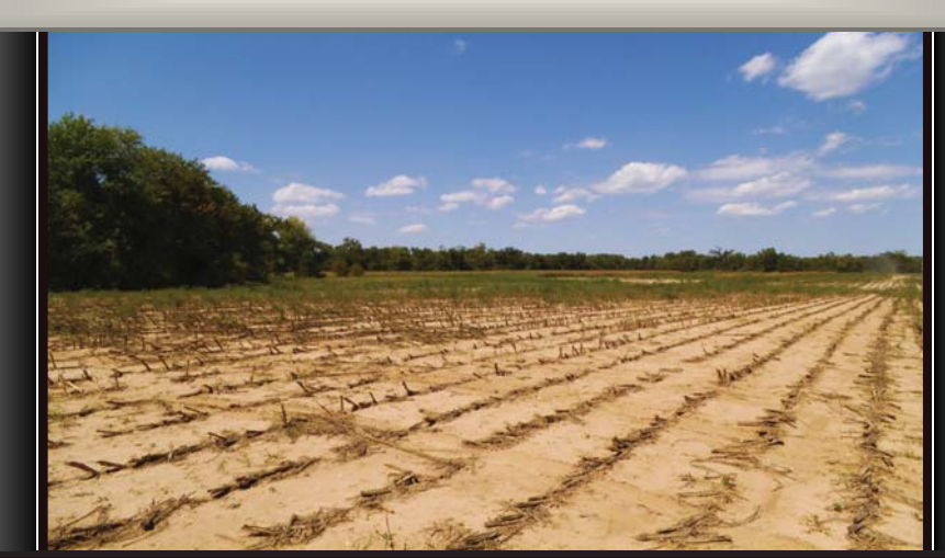
DIRECTIONS: From the intersection of Hwy. 61 and Hwy. 47, Troy, MO, go West on Hwy. 47 to RIGHT on Sydnorville Road, go approximately 2 miles to end of black top. Property starts on LEFT side of road. WATCH FOR KAIMANN AUCTION SIGNS DAY OF SALE!