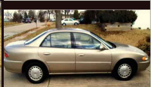
CAR - 2001 BUICK CENTURY

2001 Buick Century car, 4-door, 47,XXX actual miles, one owner, like new!