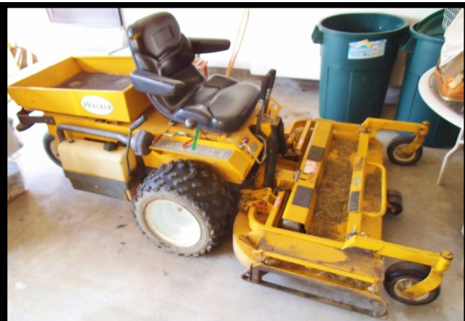
FORD 1100 4X4 TRACTOR , 209 hours WALKER RIDING MOWER , Front mount w/dump bed