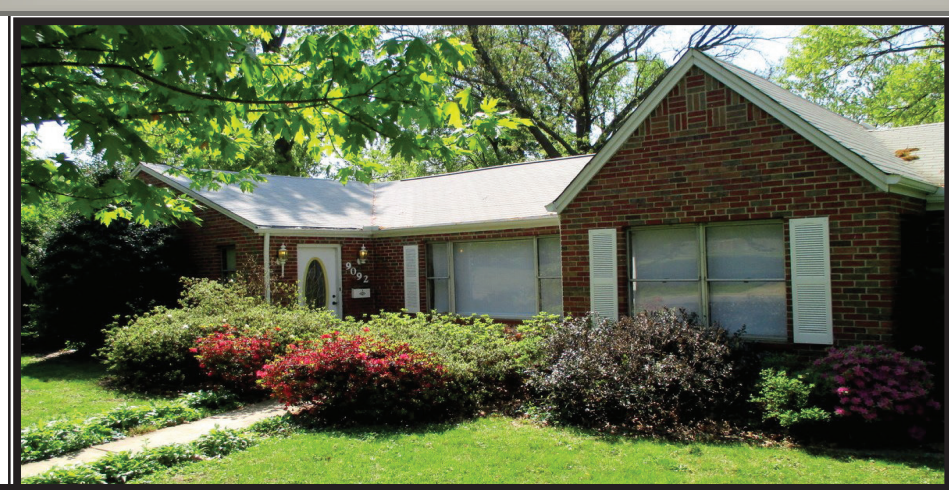
OPEN HOUSE: WEDNESDAY, MAY 6, 2015 FROM 4:00 TO 6:00 P.M.

DIRECTIONS: I-70 East to Exit 236 (Lambert), to left on Pear Tree Dr. to right on Woodson Rd. to left on Bobb Ave. to property on the corner of Patrick and Boswell. WATCH FOR KAIMANN AUCTION SIGNS DAY OF SALE. PLEASE NOTE: SALE SITE WILL BE 9092 PATRICK DR., ST. LOUIS