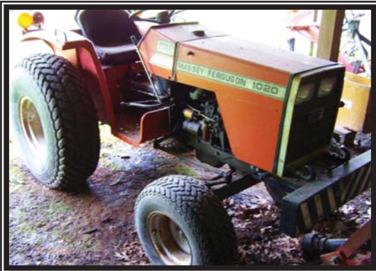
MASSEY FERGUSON 1020 DIESEL TRACTOR WITH TURF TIRES, 1372 HOURS, RUNS GOOD, W/SERVICE MANUAL