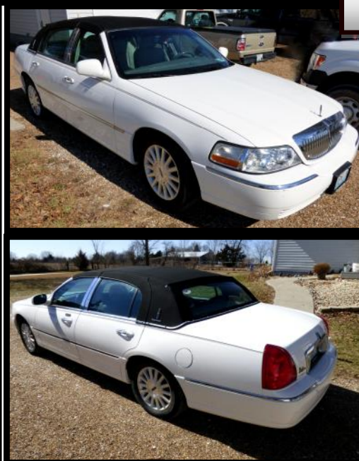
CAR - 2004 LINCOLN SIGNATURE 4-DOOR CAR, 95XXX ACTUAL MILES, WHITE WITH BLACK ROOF, VERY NICE CAR